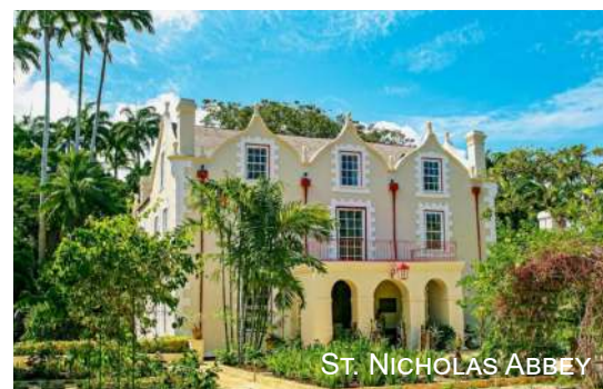
ST. NICHOLAS ABBEY