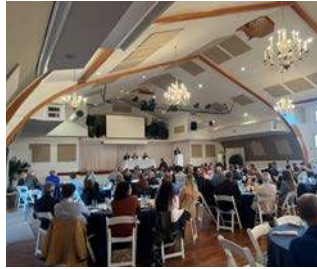
Table Sponsors: Adams Electric Cooperative, Inc.; Boyer & Ritter CPAs and Consultants, F&M Trust, Herbert, Rowland & Grubic, Inc., RKL LLP, Salzmann Hughes, P.C., SEK, CPAs & Advisors and Strickler Agency, Inc.

Coffee Sponsor: Habitat for Humanity of Franklin County