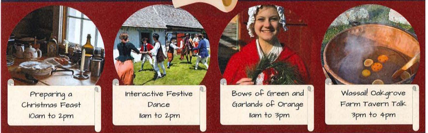
Preparing a Christmas Feast 10am to 2pm